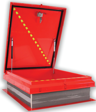
Self-Flashing Roof Hatch