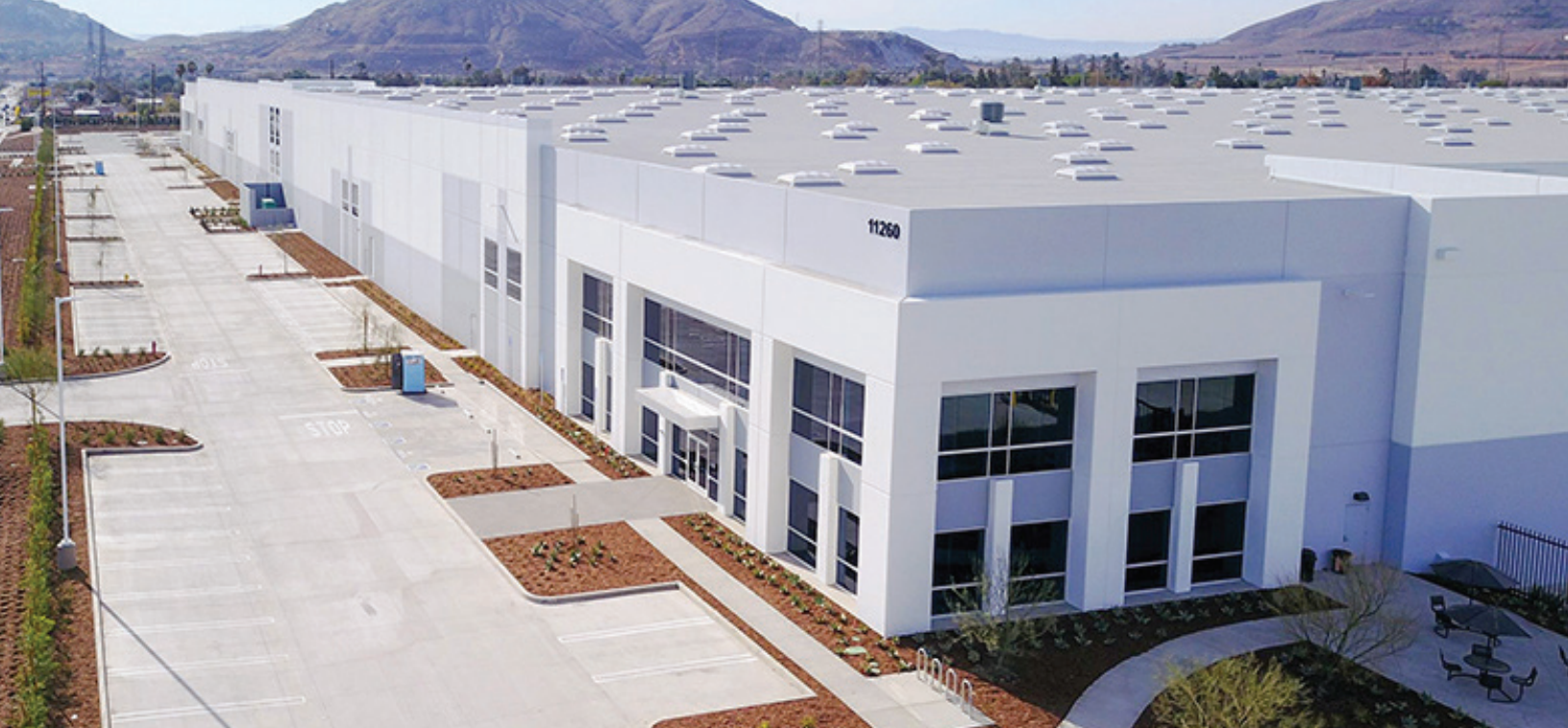
Bloomington Logistics Center General Contractor: Oltmans Construction