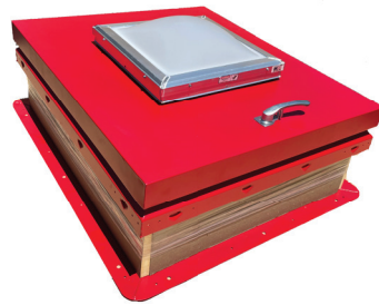
Optional Acrylic Dome