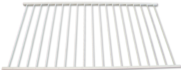
Burglar Bars BB1 (1 Piece)

Security bars are the only fall protection product to last the life of the building regardless of deteriorating elements of the plastic domes from UV Exposure, Chemicals in the atmosphere, acid rain and extreme weather.