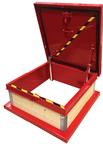
Curb Mounted Retro-Hatch