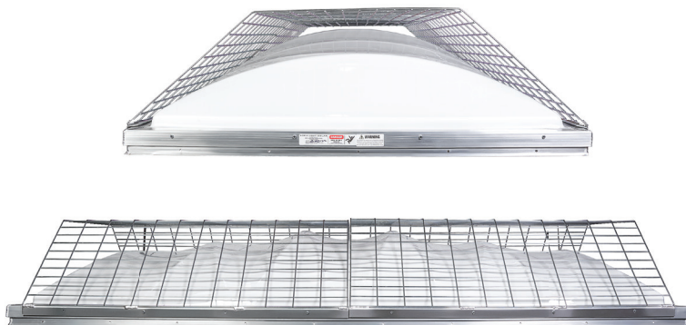
AcraGuard FPS AcraGaurd is made from a strong galvanized steel mesh.