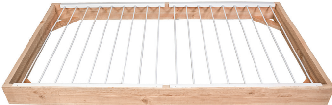
Burglar Bars BB11 (2 Piece)